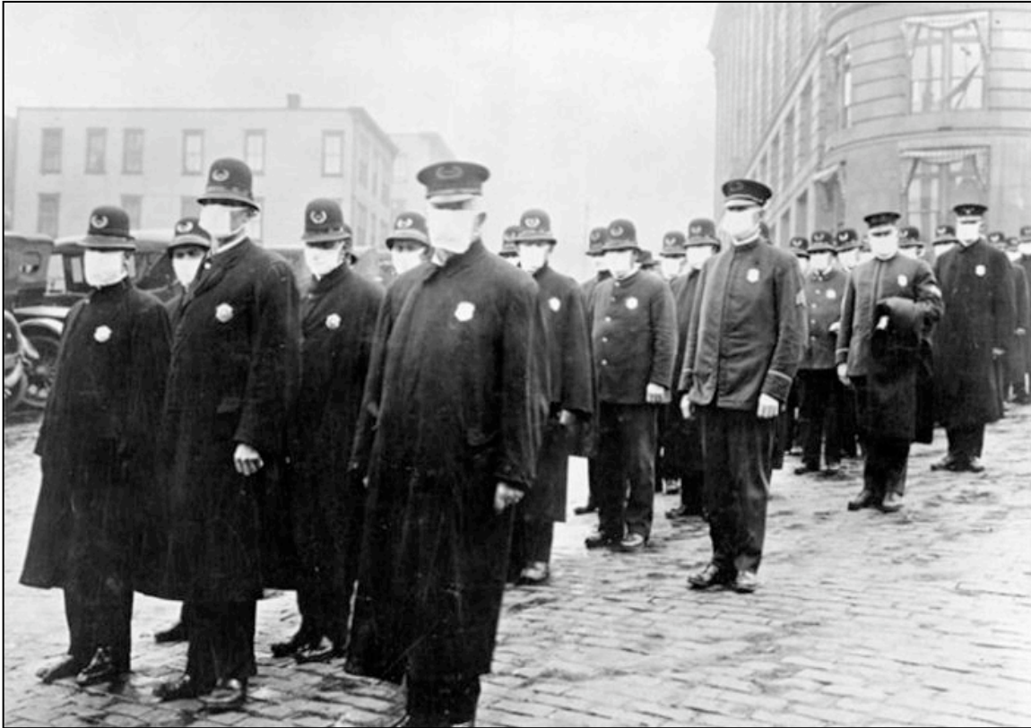
Policemen in Seattle, Washington, wearing masks made by the Red Cross, during the influenza pandemic, December 1918